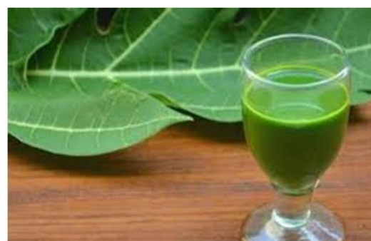
Extraction of Papaya leaf juice