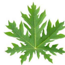
Images of Papaya and Papaya Leaf