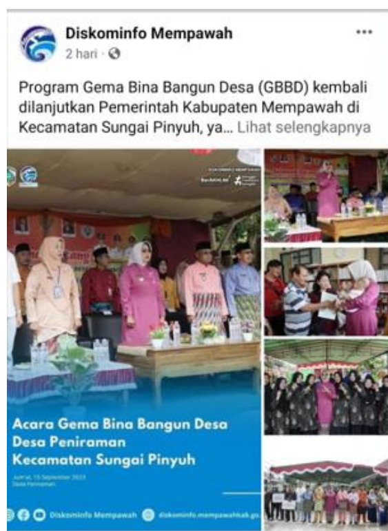
Figure 1.3. Manpawah City Government Website in Indonesia

The amount of online information provided both by the government itself, a number of other people, and internet technology and contributors (agents) is very good, because it will make it easier to find the necessary data, the government can provide the creation of a website so that the public can access information about regional data, Some from the government but more from other agents, the more information provided by the government and media/contributors online the better it will be so that people can get to know local governments more closely, have more information but it is updated every day, the information is very large and I didn't get the detailed numbers, which is very good, because it will make it easier to find the necessary data.